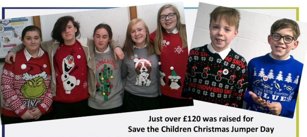
Just over £120 was raised for Save the Children Christmas Jumper Day

There is much going on in the background as well. Support for individuals, for teams and with systems. We are starting to feel the improvements and the students should be seeing them. As always, it is a work in progress, but like all journeys making a positive start is the key and that has certainly been the case. We look forward to the spring term and the next steps.